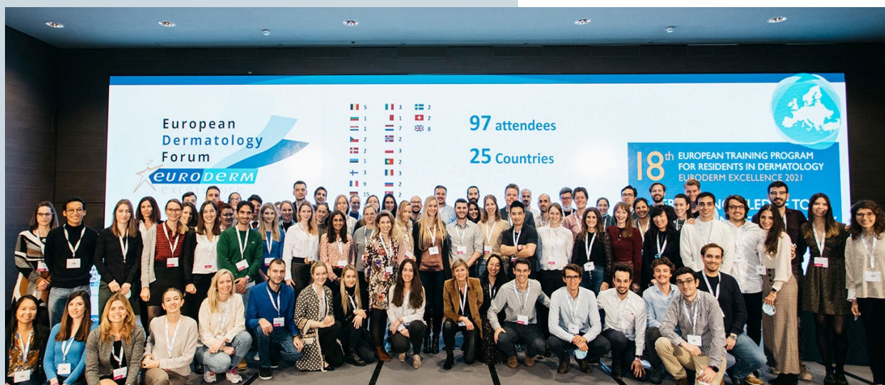
Participants of the EDF Euroderm Excellence course 2021